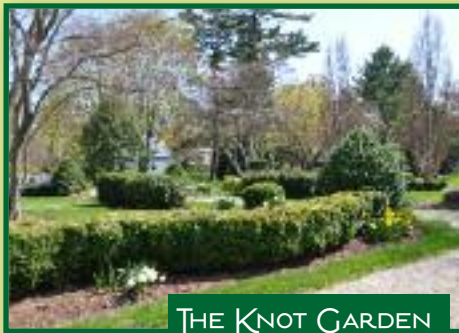
THE KNOT GARDEN

OUR MISSION Burr Homestead Gardens is the 4-acre public garden of the Burr "mansion" located in the heart of Fairfield's Historic District. Its mission is to provide a beautiful and well-maintained public open space that will reflect and enhance its historic significance, create opportunities for community education and help facilitate the garden's use for special events.