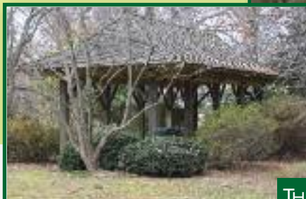
THE TEA HOUSE